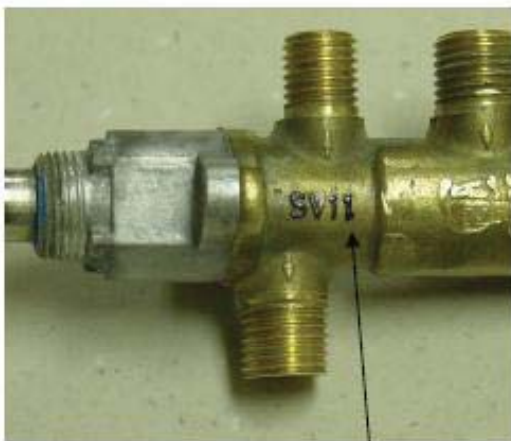
Fig. 3 Part #73983 Casting #SV11 No longer available