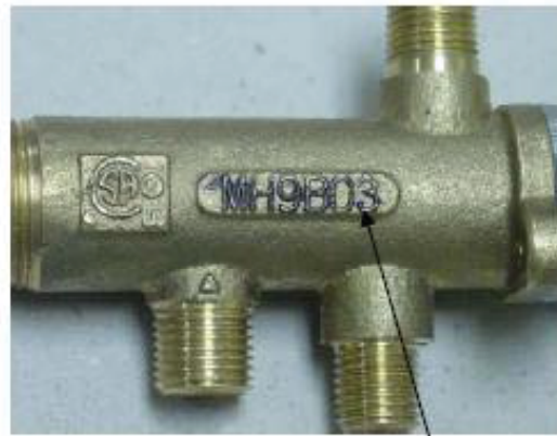
Fig. 2 Part #73482 Casting #MH9B03