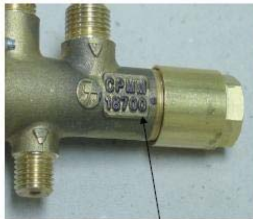
Fig. 4 Part #73492 Casting #18700